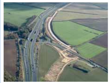
Aerial photo of scheme at Wattle Syke Roundabout.