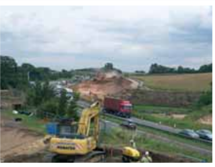
Construction work alongside Wetherby bypass looking north.

Four new local access roads, which are under construction are due to be opened next year; Spen Common Lane to Tenter Hill, Tenter Hill to Wattle Syke and Wattle Syke to Wetherby Grange will open early next year and Walton Road to Sandbeck Industrial Estate will be completed towards the end of next year.