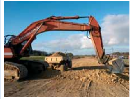
Construction work at the new local access road at Tenter Hill Bridge.

calls from BT landlines to 0845 numbers will cost no more than 4p a minute and to 0870 numbers no more than 8p per minute mobile calls usually cost more.