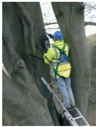
Bat boxes being installed along the route.

Care of the local environment is one of our main priorities. Archaeologists and ecologists have been undertaking work and research at the site. Ecologists are working to ensure that animal and bird life is not disturbed by the construction work and a team of archaeologists have worked at a number of key sites along the route. 42 bat boxes and one owl box were also installed at the start of the project to provide a habitat for roosting bats.