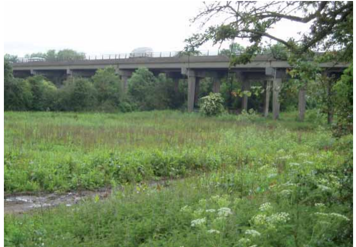
A34 Wolvercote Viaduct

By post: Highways Agency Major Projects Room 2B, Federated House London Road Dorking, Surrey RH4 1SZ