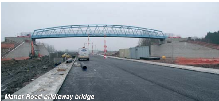
Manor Road bridleway bridge

The steel truss to the new bridleway bridge at Manor Road was erected in November. Works will continue during 2010 to construct the bridleway on either side of the new bridge.