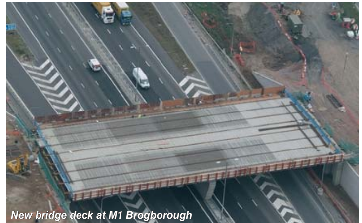
New bridge deck at M1 Brogborough

All bridge beams are now in place. The concrete deck on the M1 bridge at Brogborough has been cast and parapet construction is under way. Temporary edge protection will be removed early in the New Year which will involve some overnight disruption on the M1. The deck to Salford Road Bridge has also been completed.