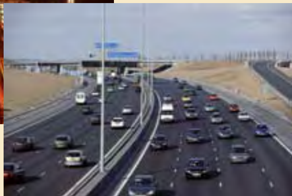
Improved Motorway at M25 junctions 12 to 15