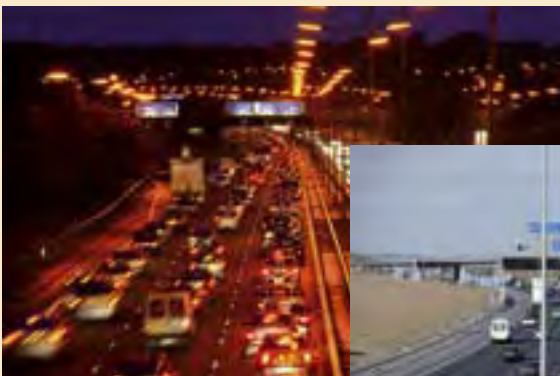
Existing Congestion at M25 Junction 21a

High levels of traffic flow lead to increased congestion and unpredictability of travel times. Congestion on the M25 is caused by a number of factors including: