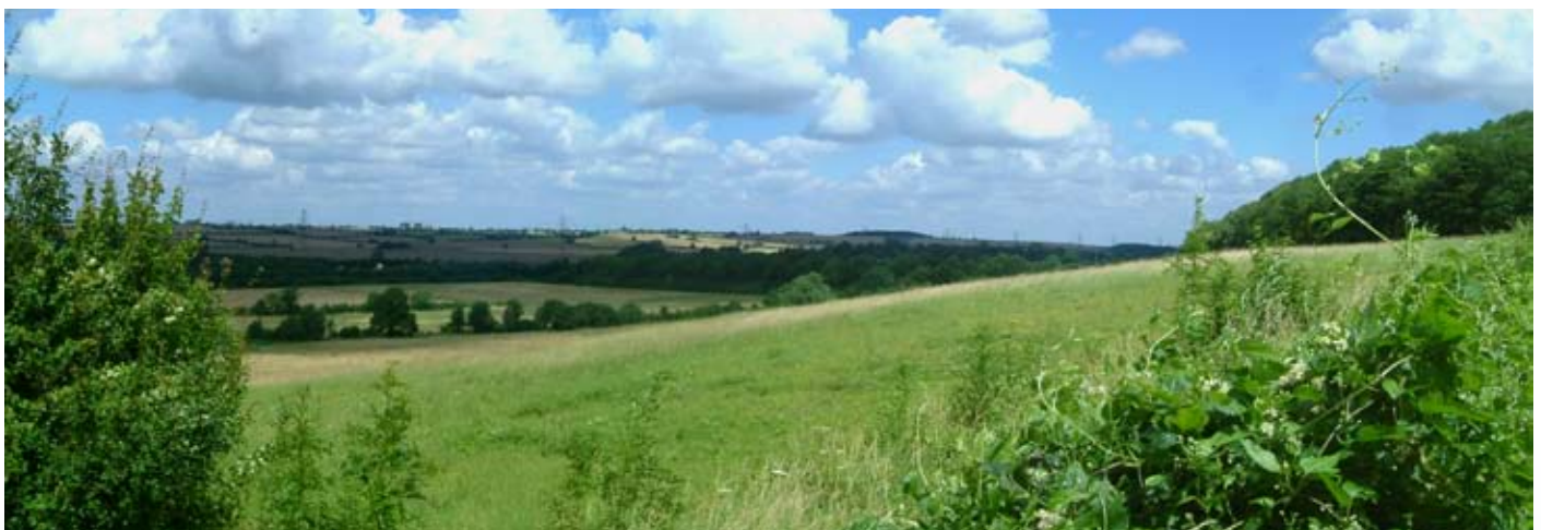
View from Sewell Lane over A5 looking north west to landscape of route