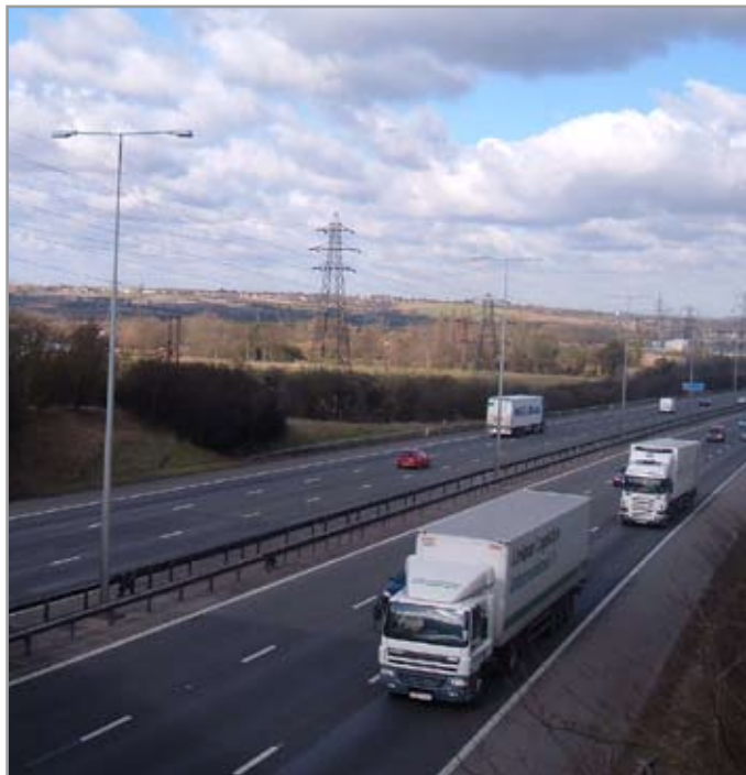
M1 at the proposed location of Junction 11A

The main scheme objective is to improve unreliable journey times on the A5 by providing a link to the M1 that is an alternative to the A5 through Dunstable. This would reduce the presence of long distance traffic in Dunstable going to or from the M1. In Dunstable, where congestion is worst, it affects safety and environmental conditions (such as air quality).