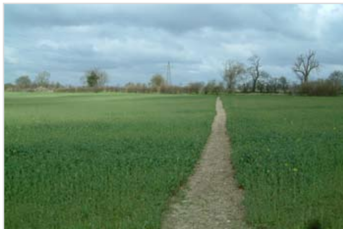
Typical view of arable landscape

The Northern Route was formally announced as the Preferred Route in February 2007 by the Secretary of State for Transport. Since that date, the scheme design has been developed, integrating the road design with structures, earthworks, drainage and environmental requirements.