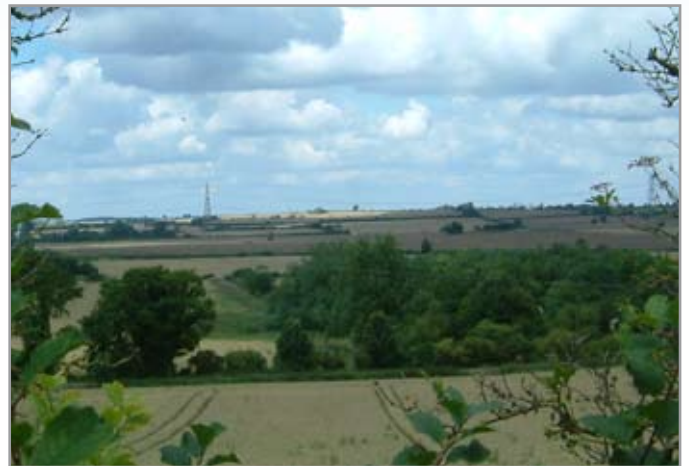
View across the valley and Scheme at western end

The scheme would also require the demolition of five residential properties - four of them on Luton Road on the site of the proposed Junction 11A and Chalton Cross Lodge just to the west of the M1.