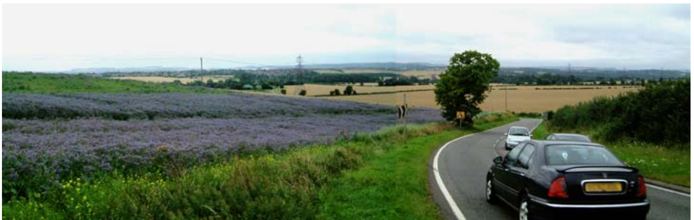
Approach on A5120 from Toddington

The construction programme would start with “Advance Works” (such as site preparation and clearance) from late 2010. Construction would then start on the links with the existing roads and the motorway slip roads starting from Spring 2011. The construction of the main road, including the bridges and other structures, would take place between Spring 2012 and Autumn 2013. The construction programme finishes with the landscaping in late 2013 and the start of a five year aftercare period.