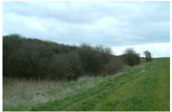
Vegetation alongside Ouzel Brook

The area around the scheme supports a range of breeding and wintering birds, although the densities are low. To minimise impacts, vegetation clearance would be avoided during the breeding season and planting of native shrubs, trees and hedgerows as well as the creation of flower-rich grasslands within the landscape design would result in a net gain in suitable breeding and foraging habitat.