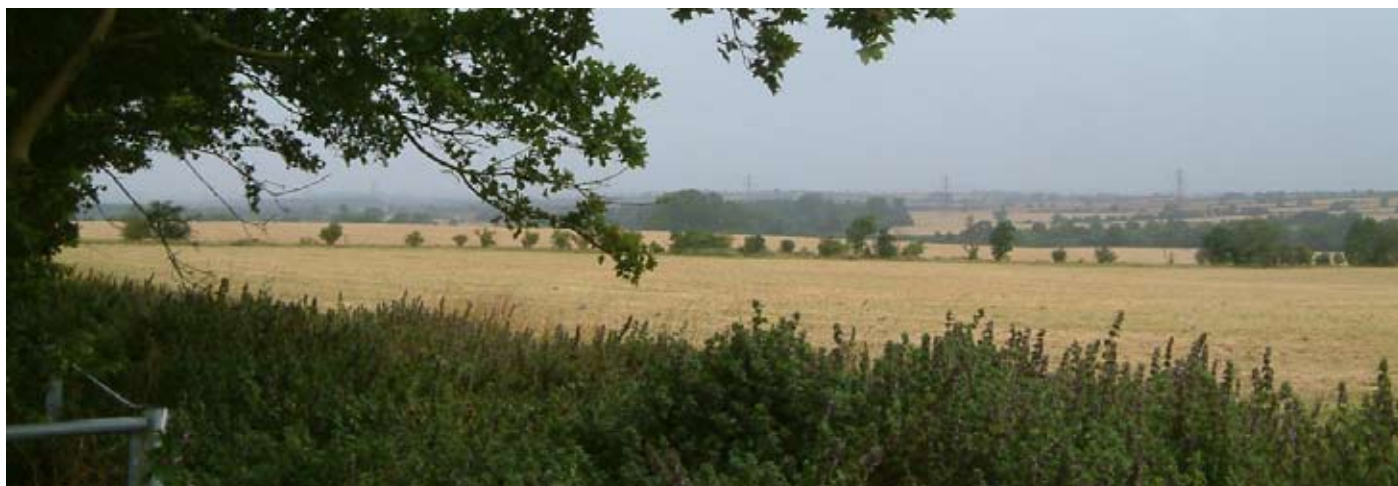
The Ouzel Valley

The full Environmental Statement will also be available via a link on the Highways Agency website, www.highways.gov.uk