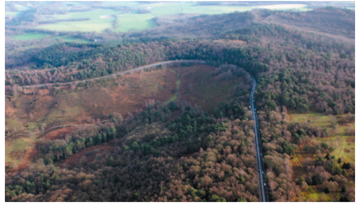
Aerial shot of Punch Bowl bend

June - October 2007. We will construct the