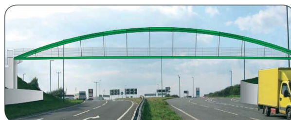
Figure 2 - North view of proposed bridge design 2