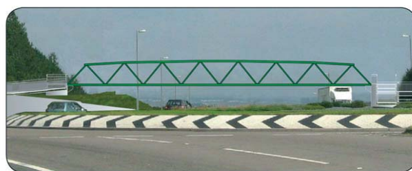
Figure 1 - South view of proposed bridge design 1