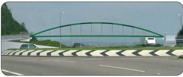
Figure 2 - South view of proposed bridge design 2

however they are only artistic impressions, and the final design may vary from this.