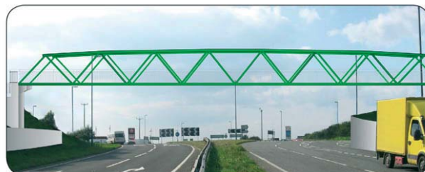
Figure 1 - North view of proposed bridge design 1

The options for the bridge include straight (figure 1) or curved (figure 2) designs. Typical examples of these are illustrated below,